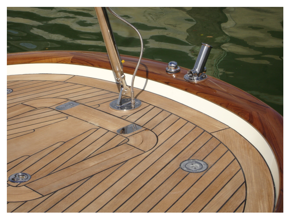
Aft deck – custom flag socket for dinghy towing, stainless steel hydraulic backstay, and flush plate for fresh water hot/cold deck shower FRIENDSHIP YACHT COMPANY

The foredeck houses two flush lockers – to port is the swing out anchor system with Lewmar electric windlass and saltwater wash down, to starboard is the chain locker with storage for swim ladder and dinghy outboard motor. The custom chocks in the cap rail are larger on the foredeck than those aft to accommodate large mooring lines, and the cleats are flush to the deck when not in use. On centerline is an additional, extra strength pop-up pad eye for hurricane tie down.