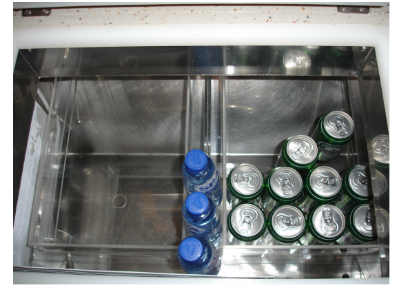
Removable shelving in fridge