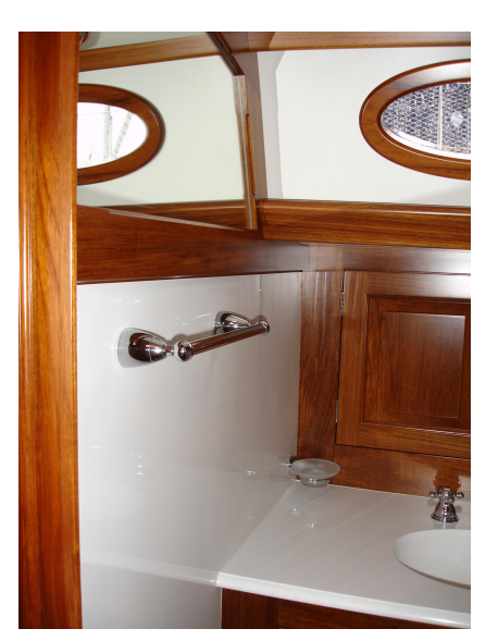
Head with teak framed mirror, Corian countertop, shower and electric fresh water head