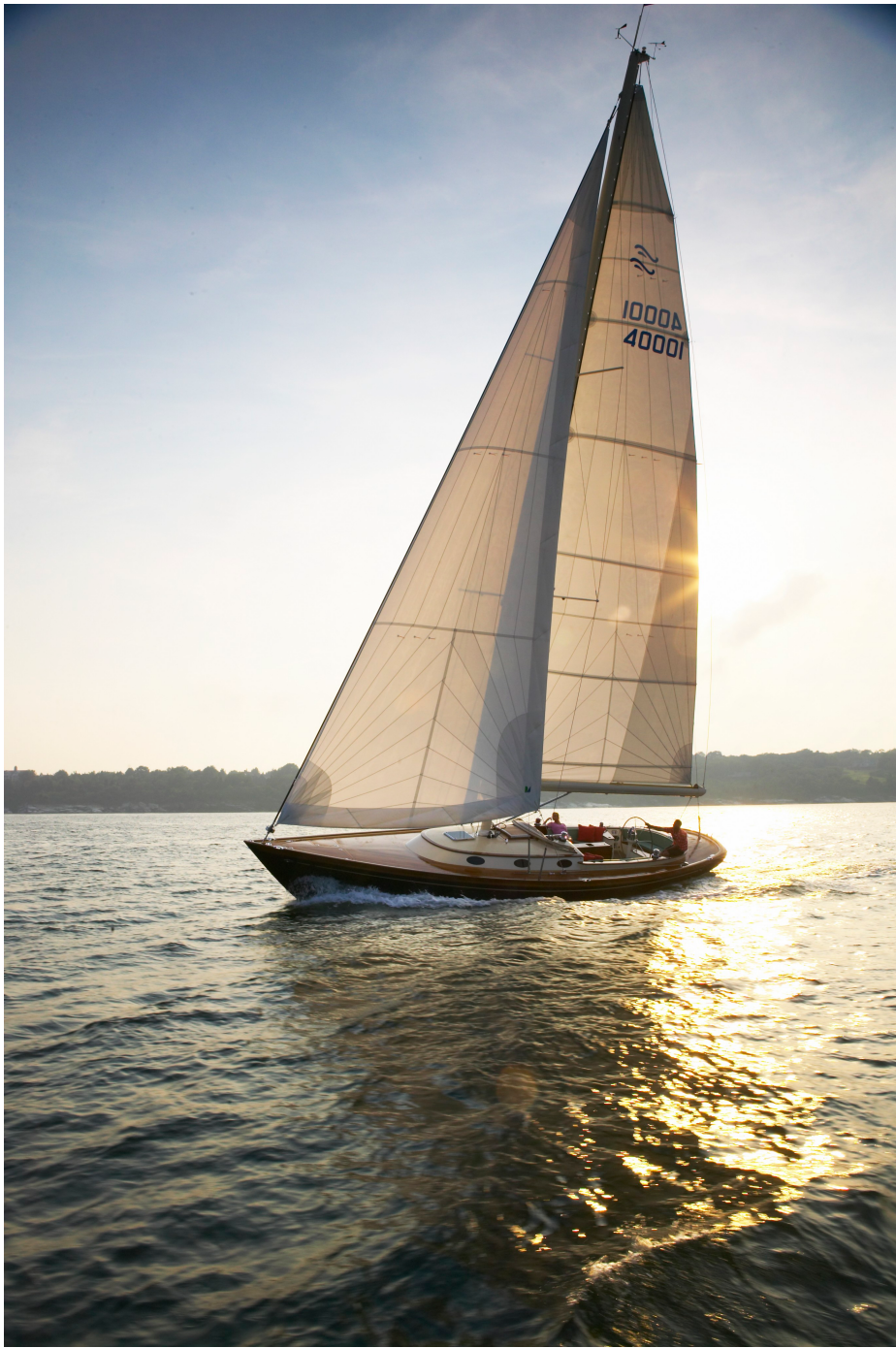
Friendship 40-01 MAANAKI is shown in photo.