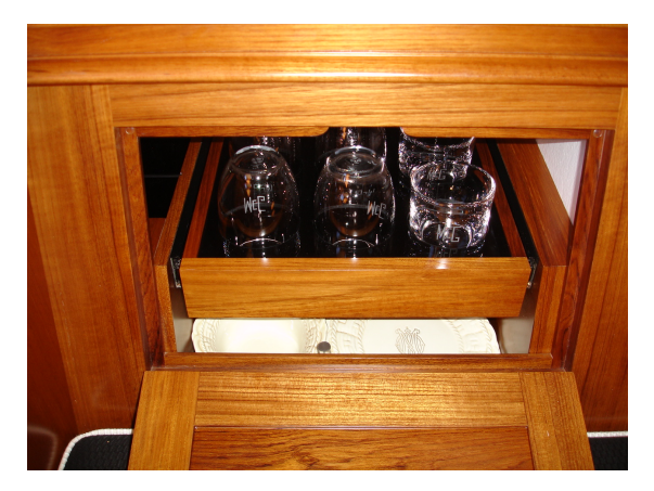
Custom dish storage