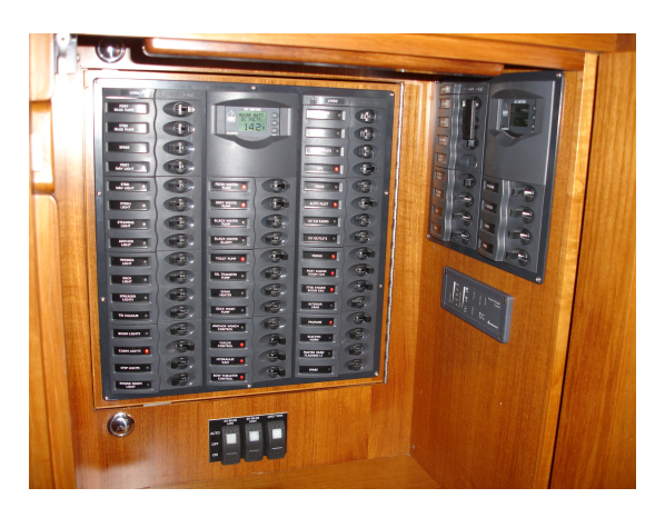
Hidden electrical panel