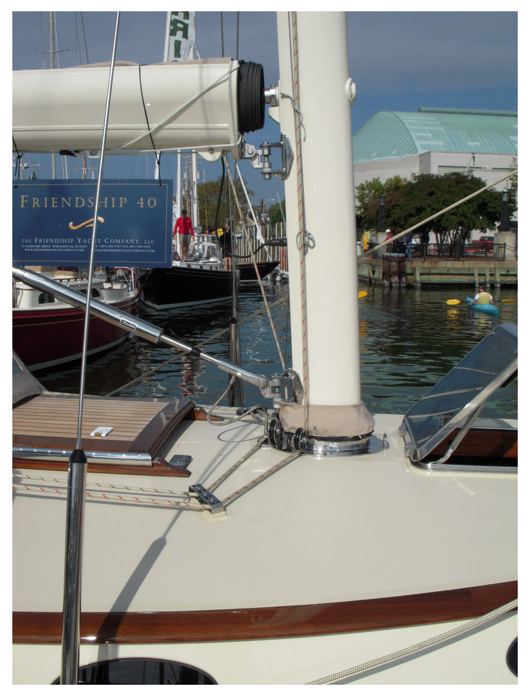
Stainless steel hydraulic vang, in-boom main furler, and mast collar with custom built-in stainless steel turning blocks.

The two secondary winches on the house top provide push button control of centerboard control, spinnaker halyard, back-up main halyard and preventer. All lines have flush, stainless steel lined bins for clutter-free storage. All four deck winches are stainless steel Lewmar two-speed electric.