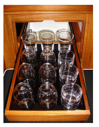
Pull-out shelf for glasses