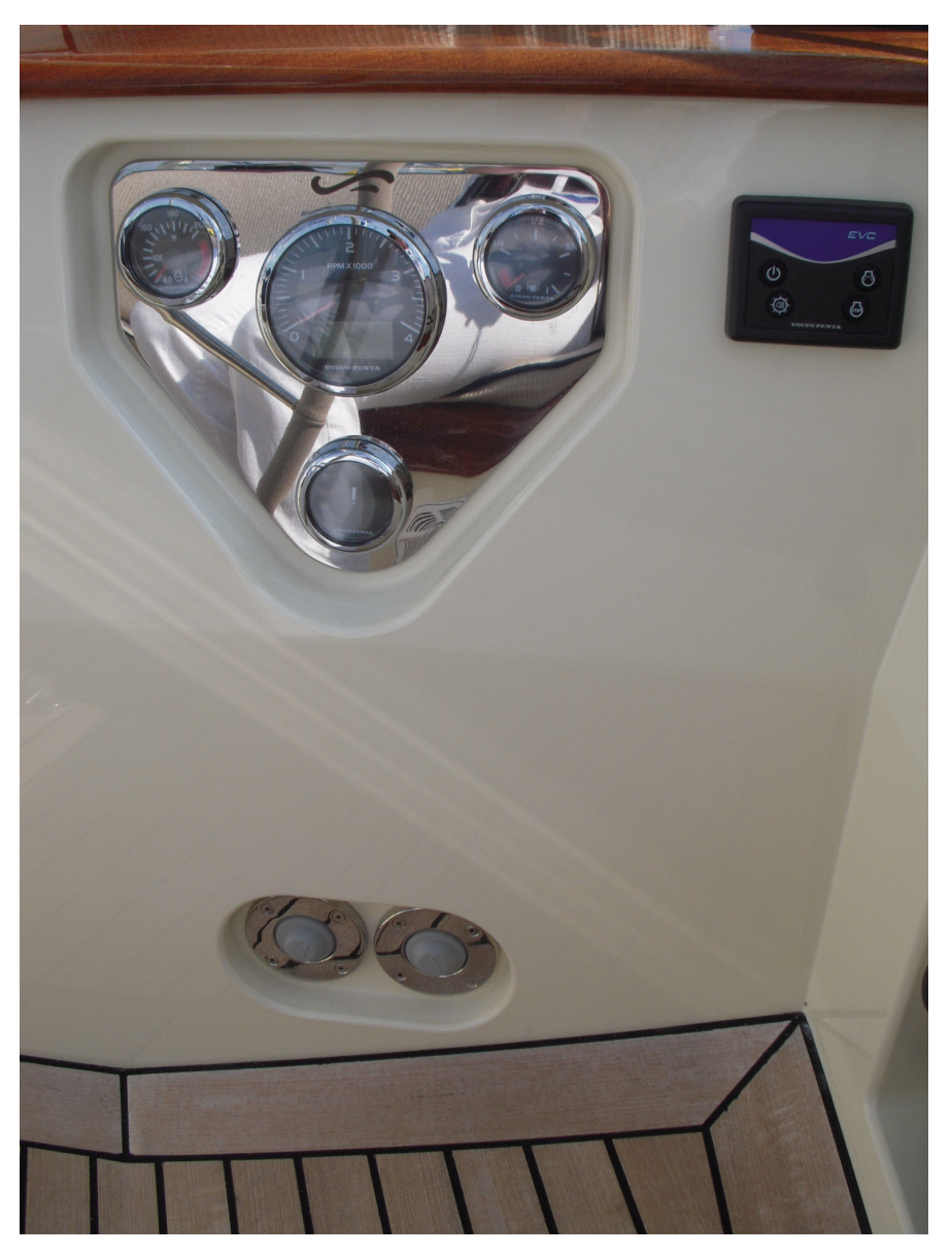
To starboard of wheel: engine panel and genoa furler buttons

Brand new (2024) +North 3di Endurance in boom furling mainsail and roller furling genoa on order, then new sails and will be included in the sale of the vessel. The hydraulic mainsheet system of the Friendship 40, controlled by two, Antal ss foot buttons at the helm, brings new levels of ease to sailing. All sail handling is done using push buttons located within finger's reach from the helm seat. A Reckman electric headsail furler effortlessly controls the jib using two, Antal ss foot buttons at either side of the helm. The bow thruster is also controlled by two, Antal ss foot buttons located at the base of the wheel.