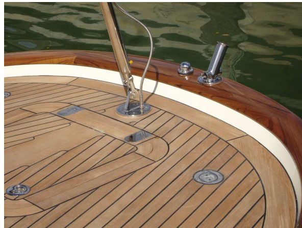
Aft deck – stainless steel flag socket, stainless steel hydraulic backstay, and flush plate for fresh water hot/cold deck shower

WICKED is available immediately, an incredible value without having to wait the standard 12-month build period for a new Friendship 40. It is a rare find, a Friendship 40 on the used market let alone the youngest one of the fleet. She is a testament to how well