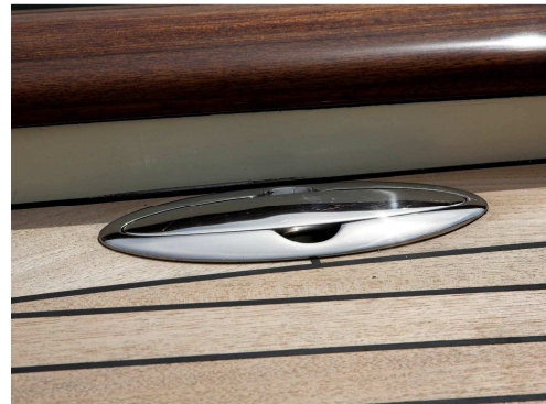
"Unstubbable" flush cleats