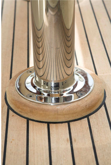
Stainless steel table legs in cockpit

Some standard Friendship 40 detail photos: