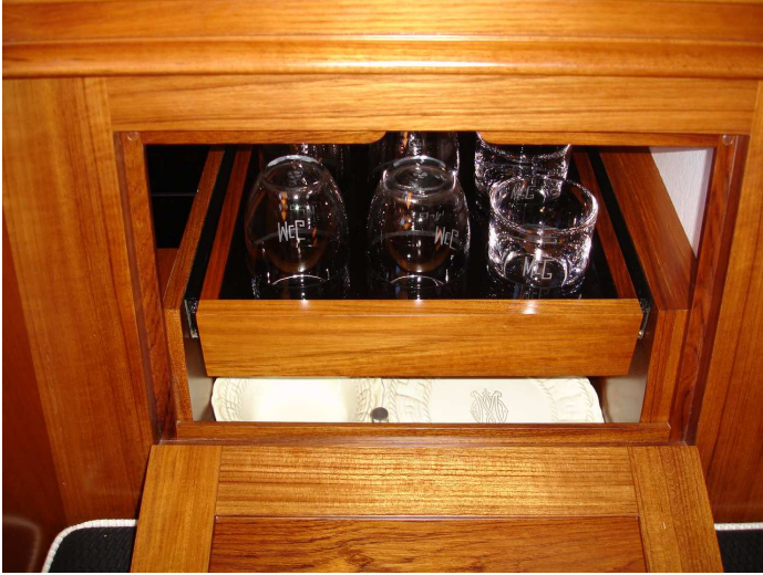
Custom dish storage