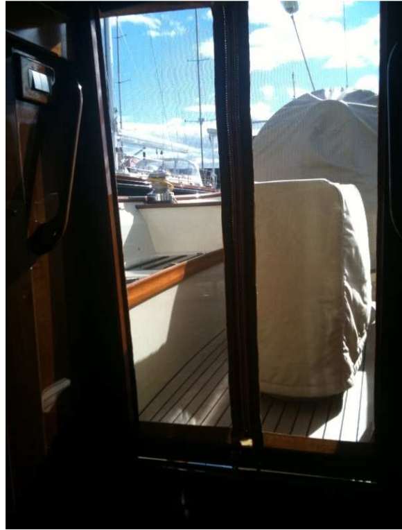
Custom zippered bug screens for companionway