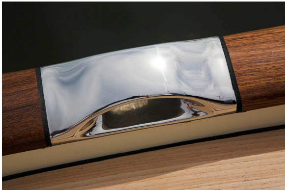
Custom cast stainless steel chocks