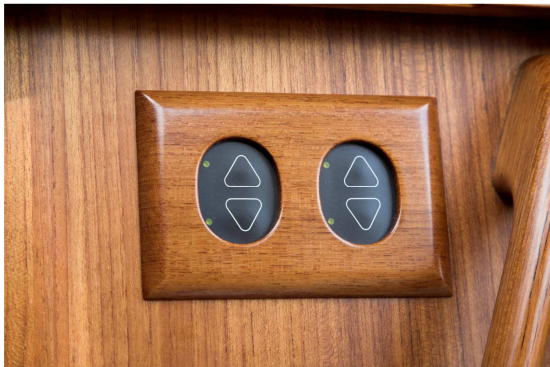
Dimmer switches for boom lights