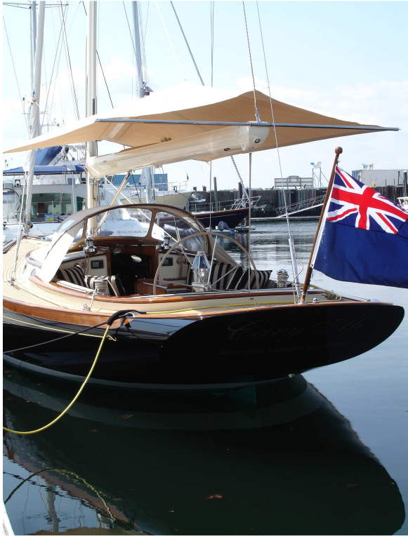
Sun awning (Hull 10 pictured)