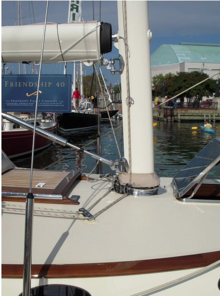
Stainless steel hydraulic vang, in-boom main furler, and mast collar with custom built-in stainless steel turning blocks.

The two secondary winches on the house top provide push button control of centerboard pennant, spinnaker halyard, main halyard and preventer. All lines have flush, stainless steel lined bins for clutter-free storage. All four deck winches are stainless steel Lewmar two-speed electric.