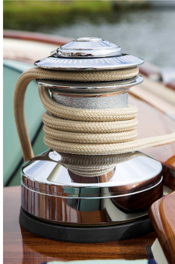
Electric Lewmar winches