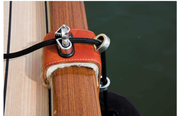
Custom leather and lambskin fender holders