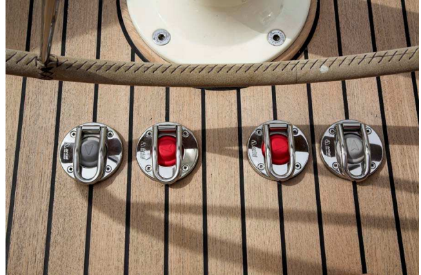
At foot of helmsman: mainsheet and bowthruster control

The hydraulic mainsheet system of the Friendship 40, controlled by two foot buttons at the helm, brings new levels of ease to sailing. All sail handling is done using push buttons located within finger's reach from the helm seat. A Reckman electric headsail furler effortlessly controls the jib using two foot buttons at either side of the helm. The bowthruster is also controlled by two foot buttons located at the base of the wheel.